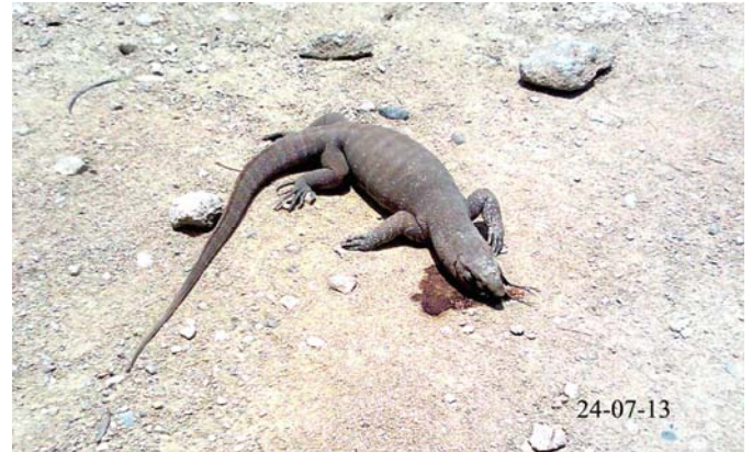
Fig 5: Varanus bengalensis (Mortality during road crossing)