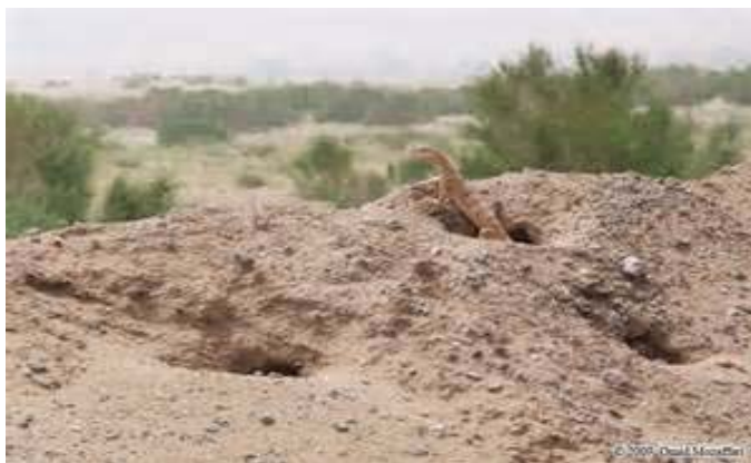
Fig 4: Varanus griseus (Desert Monitor) Burrows, Natural Habitat