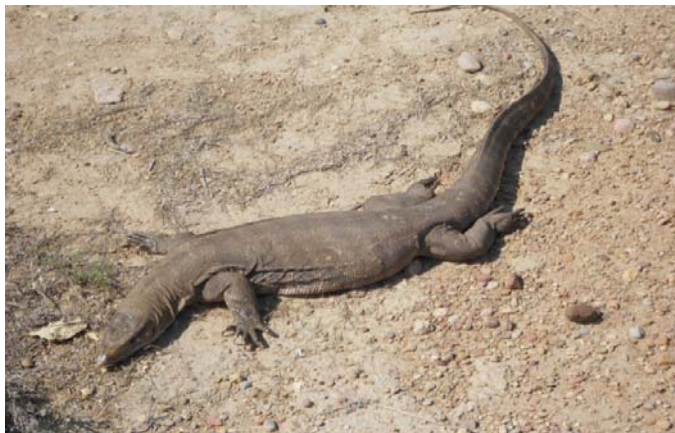
Fig 3: Varanus bengalensis (During Sun Bath)