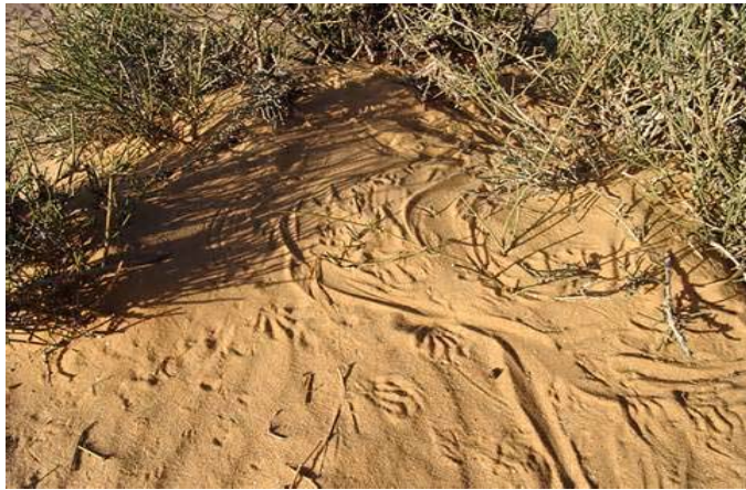
Fig 2: Presence of Sign of Varanus spp. (Foot Claws Print, Tail Signs etc.)

In present studies, it was found that two species of Varanids are present in Karachi and Thatta districts of Sindh, in which Varanus bengalensis is most commonly occurring in study selected areas (Karachi and Thatta). Varanus bengalensis show much variation and distribution in their natural habitats and rich in numbers. mostly found in natural habitats in Thatta area, but in Karachi several new types of (un-natural) habitats were observed. While Varanus griseus is only occurring in their natural habitat in Thatta only. All Varanus species are threatening by human activities and need special conservational management & research in to the natural history.