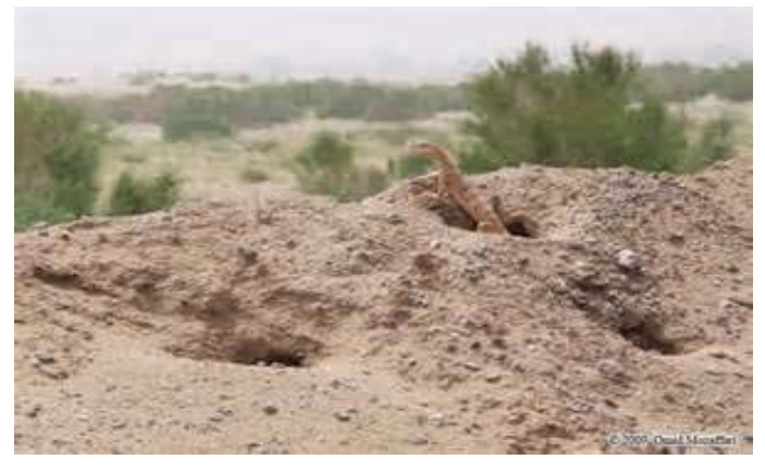
Fig 4: Varanus griseus (Desert Monitor) Burrows, Natural Habitat