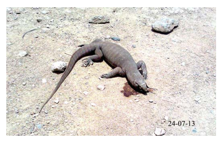
Fig 5: Varanus bengalensis (Mortality during road crossing)