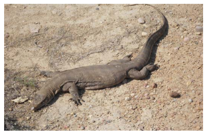
Fig 3: Varanus bengalensis (During Sun Bath)