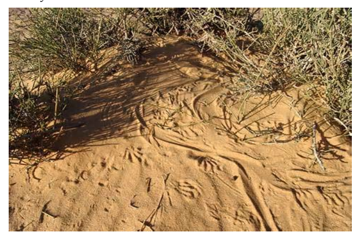
Fig 2: Presence of Sign of Varanus spp. (Foot Claws Print, Tail Signs etc.)

In present studies, it was found that two species of Varanids are present in Karachi and Thatta districts of Sindh, in which Varanus bengalensis is most commonly occurring in study selected areas (Karachi and Thatta). Varanus bengalensis show much variation and distribution in their natural habitats and rich in numbers.mostly found in natural habitats in Thatta area, but in Karachi several new types of (un-natural) habitats were observed. While Varanus griseus is only occurring in their natural habitat in Thatta only. All Varanus species are threatening by human activities and need special conservational management & research in to the natural history.